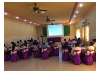
Identification of ISA (challenges, responsibilities/mandates)