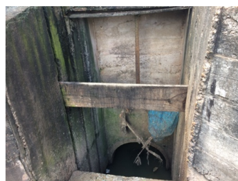
Part of colonial sewer network in Kratie's city center