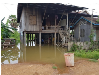
Annual flooding events leading to overflowing septic tanks

Solid waste collection coverage is limited to about 20 percent of the city's households leaving the majority of solid waste to illegal dumping or on-site burning. Current operators of sanitation services, such as desludging and waste collection are struggling with either unregulated or unenforced tariff systems. Consequently, the quality of services lacks standards and professionalism, which severely affects both clients and workers employed in the sector.