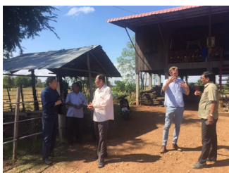
Governmental field visit to new Material Recovery Facility