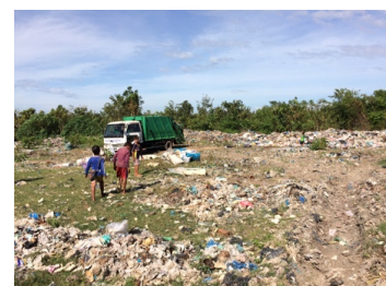
Informal recycling activities at Kratie's primary dumpsite