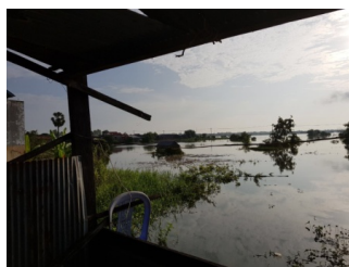
Nearby lake as destination of current informal disposal