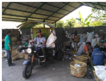
Material Recovery Facility