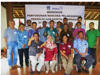
Government training on Integrated Sanitation