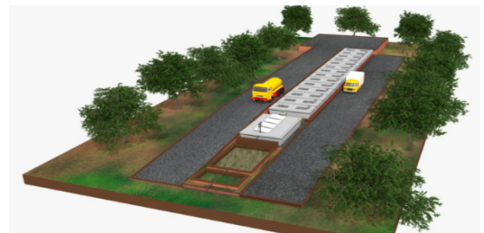
Design of Sludge Treatment Plant